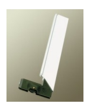
8 sections of inner frame for 2 panel slider