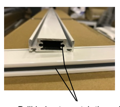
Drill holes to match these holes.