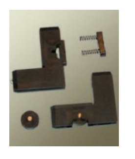
8 corner pieces Wheels with horizontal kit Friction pads and springs with vertical kit